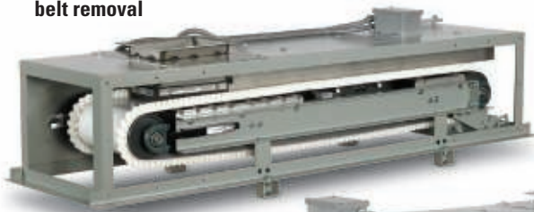
Thermo Scientific Ramsey Model 90-150 Low Capacity Weighbelt Feeder

Cantilevered frame and quick release take-up for easy belt removal