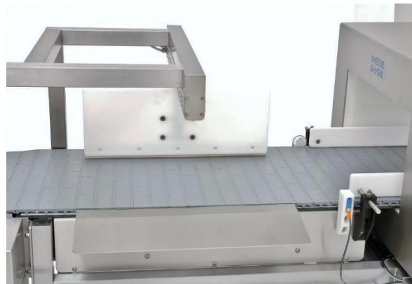
METAL SHARK BD with HQ Conveyor and Linear Pusher LP

Metal detector METAL SHARK® BD is used free-standing or combined with conveyor belts or chutes. Using 3D detection technology, it detects the smallest magnetic and non-magnetic metal contaminants (iron, stainless steel, aluminium etc.) precisely and reliably even under difficult conditions. The robust, closed stainless steel housing is easy to clean and therefore ideally suited to the food industry.