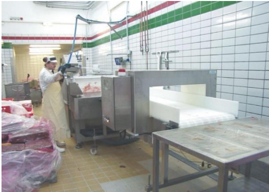
METAL SHARK BD with HQ Conveyor for meat