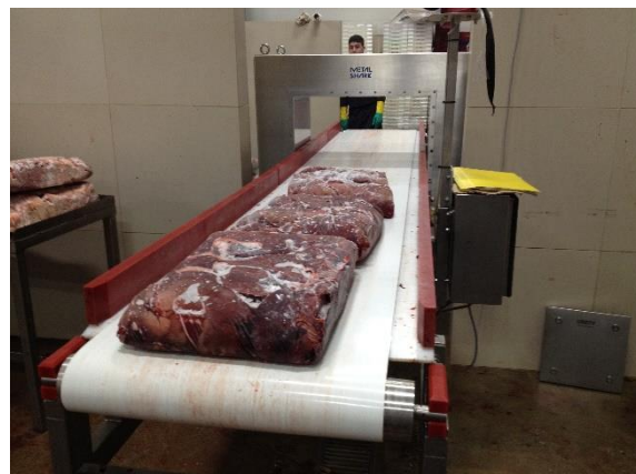
METAL SHARK BD with HQ conveyor for unpacked frozen meat blocks